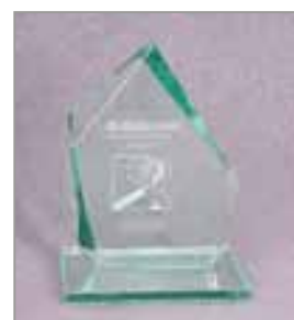
Another Golden Ear for Harbeth

ing at all". For Japan's Stereo magazine the speaker was awarded Excellence status by a panel of four reviewers. Sister title Stereo Sound spoke of "excellent reproduction of harmonic structure", while Audio Accessory crowned it with a Best Component award.